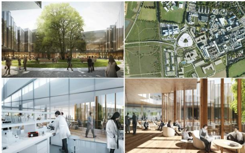
MRC | Medical Research Council